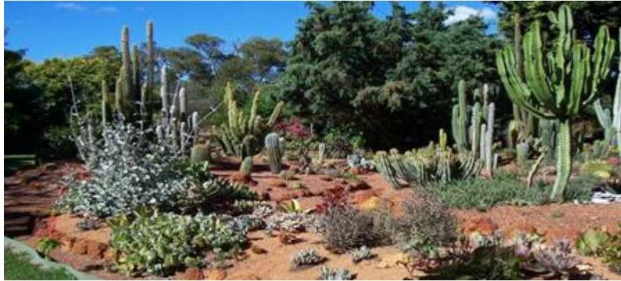
of the beautiful Botanical Gardens that we visited recently.

Morning tea at Meadow Springs Golf Club, Social evening at the Rotunda, Sundowner BBQ at the Foreshore, Morning teas at Merchants Tea House and WA Botanical were also memorable occasions enjoyed by many.