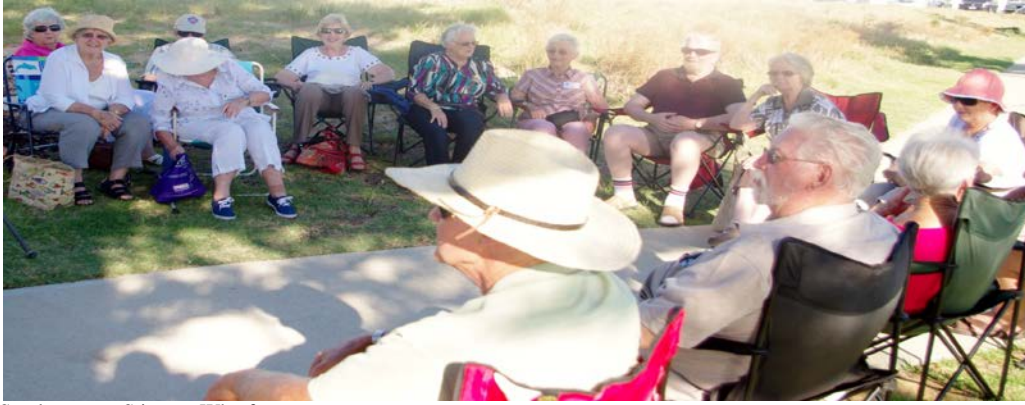
Sundowner at Stingray Wharf

March 14th 2012 – Morning tea at Cicerellos on the Boardwalk.