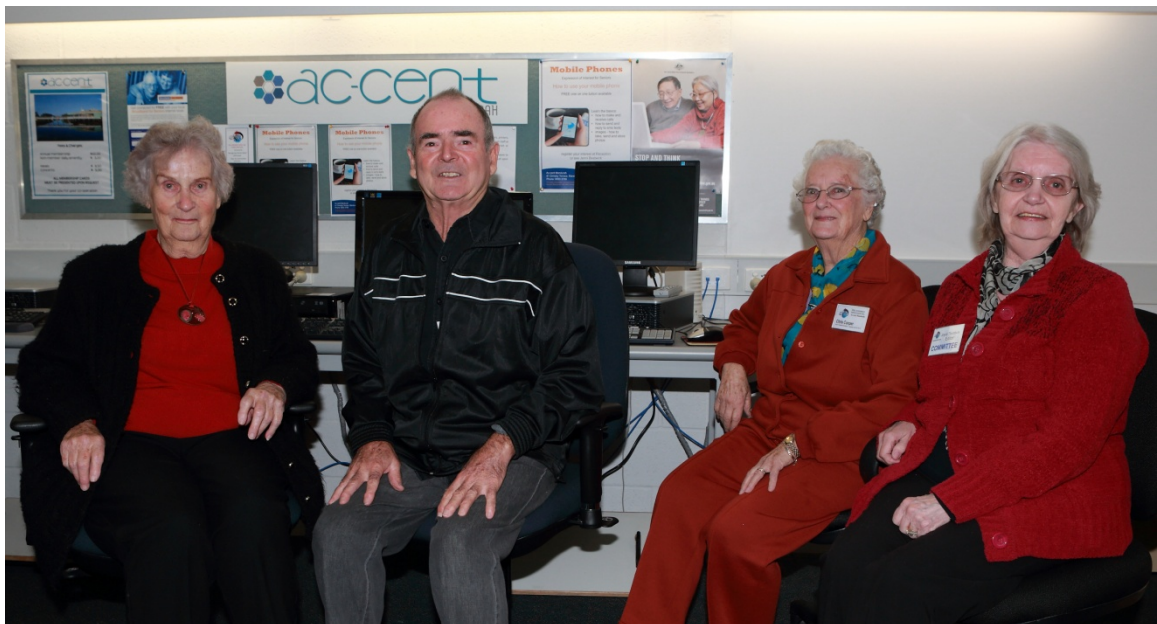
Airing and Sharing Views. Courtesy: Ms.