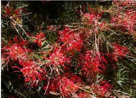
Red Grevillea, Jarrahdale.

Finally a large thank you to the team at Ac-cent who help us with our mantra.