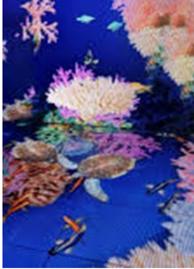
In Pinjarra Zoo